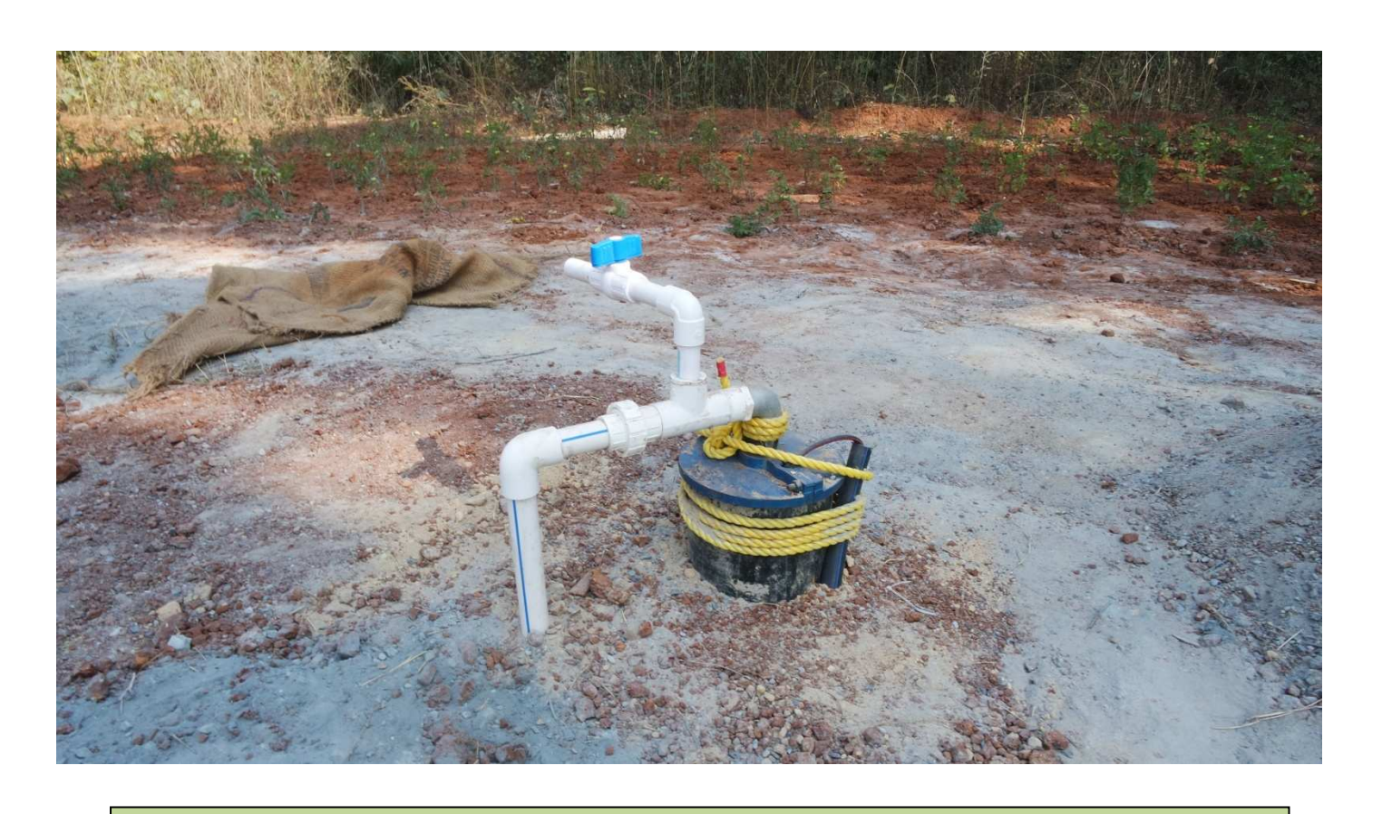
Submersible pump set is fitted in the deep bore well (Up and down)